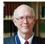
George Whitesides, PhD Technical Founder & Board Member